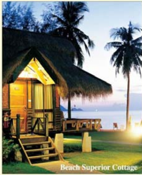
Beach Superior Cottage