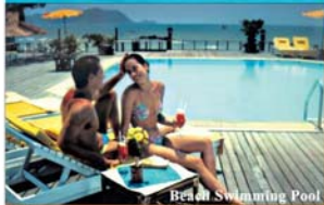
Beach Swimming Pool